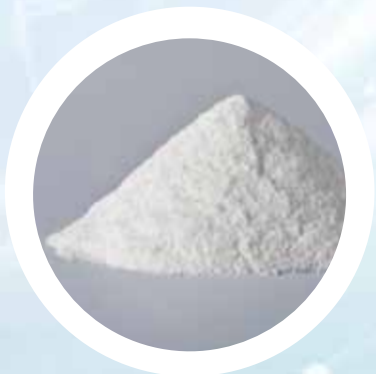
HA SPRAY POWDER