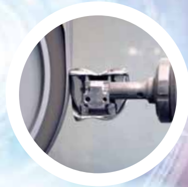
FINISHING AND POLISHING